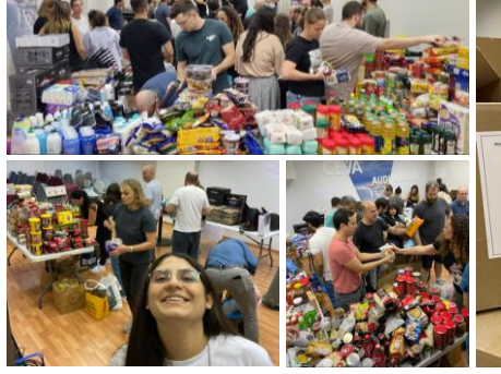
Ceva family gathered to volunteer and donate to Israel's southern communities. Together we packed over 60 boxes full of essential items and wholehearted support.