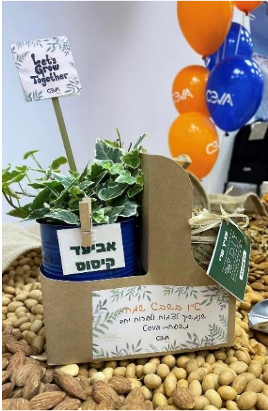
Ceva purchased pots and herbs for workers from "Fresh Pot," a social enterprise that employs people with disabilities.