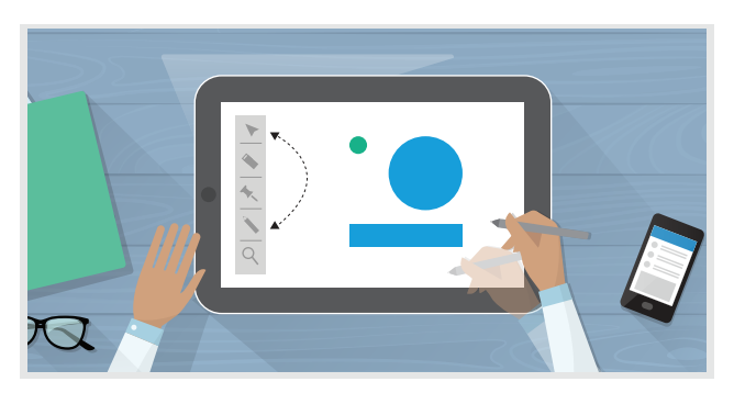
A graphic artist sketches on a tablet, using small movements to quickly enable shortcuts such as changing the brush type or picking a color from the palette