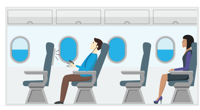
A passenger can lean back and relax while interacting with an in-flight screen through a control that's almost like an extension of their body