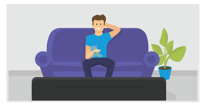
A viewer can use a smooth wrist motion to point to and select menu options on their TV without digging through a grid of menu options