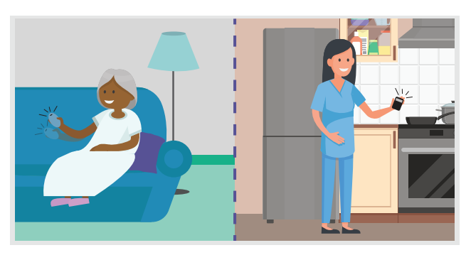
An elderly parent is able to page their nurse from a different room or floor with just a flick of the wrist