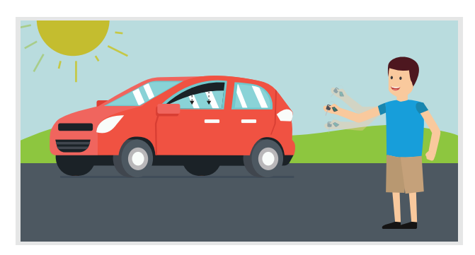
A driver mimes a circular motion as they approach their car on a sizzling summer day, and the windows roll down to start airing it out