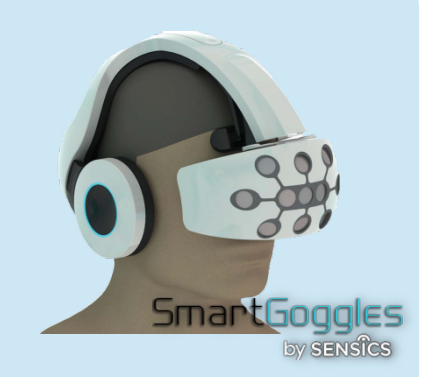
The FSM-9 provides smooth and responsive motion for ultimate gaming.