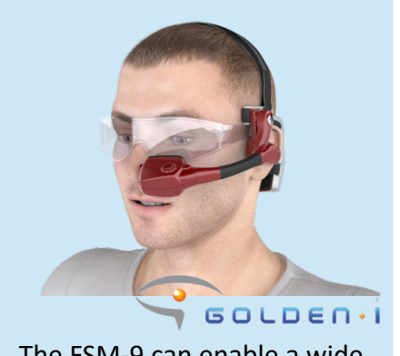
The FSM-9 can enable a wide range of hands-free controls on head mounted displays.