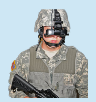
The FSM-9 enables the most immersive virtual reality experiences.